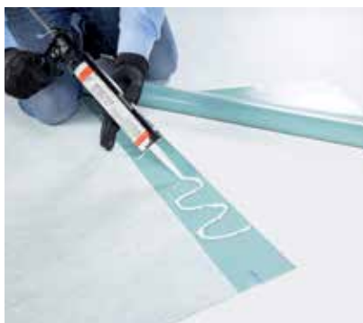
Sealing by mastic glue RENOLIT CEM 805 .

Shortly afterward the installation, compress the overlaps with a roller to ensure a complete adhesion